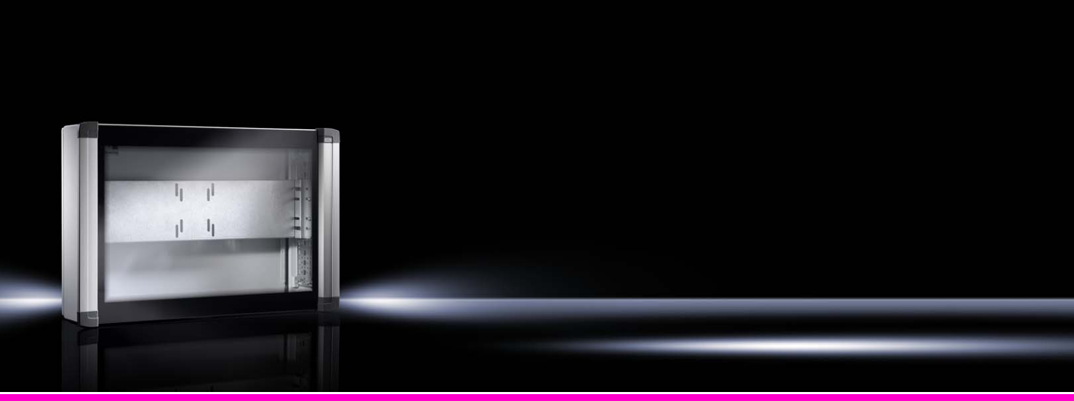
System accessories Page 507 Support arm systems Page 135 Stand systems Page 164

For the installation of commercially available desktop TFTs with a screen diagonal of up to 24" in the formats 16:9/16:10.